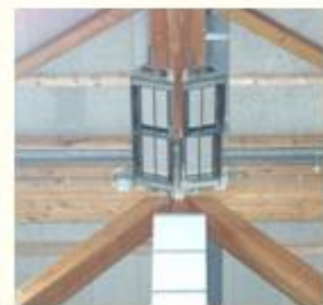
PATINOIRE, Malley Lausanne - 9'600 m 2 - H = 17 m - Power: 3'000 KW + 24° Bei -10°