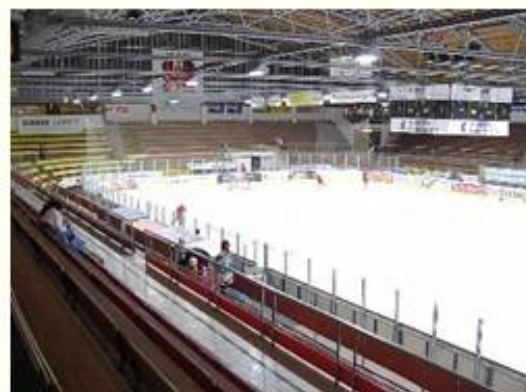
HALLENSTADIUM, Chur - 6'000m 2 - H = 14 m - Power : 2'500 KW + 18° Bei - 10°